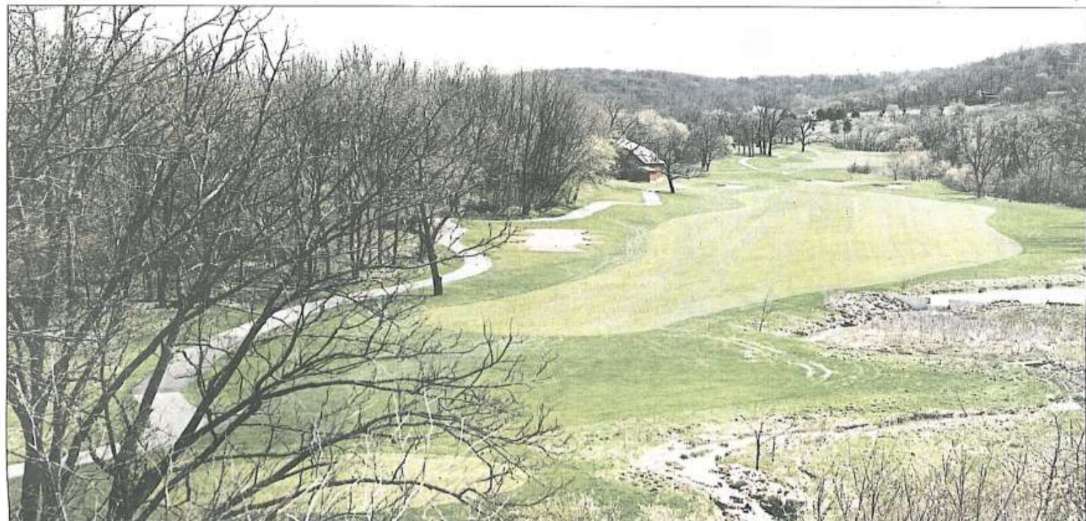
The North course opened at Eagle Ridge in 1977. The view from the 11th hole hints at the elevation changes that make the courses challenging but fair, just the way golfers like them.

Chicago Tribune SUNDAY, APRIL 18, 2010 | SECTION 5