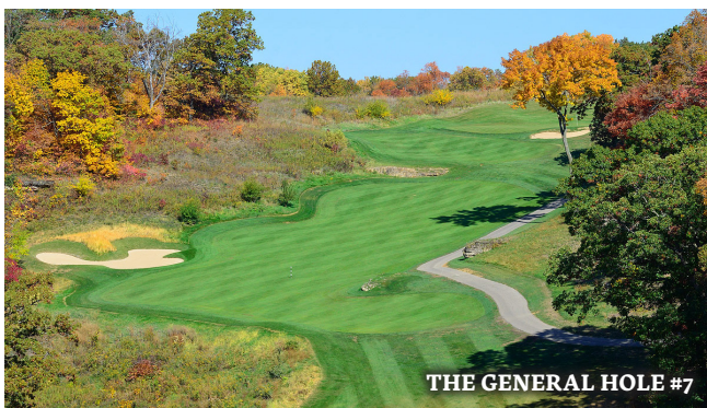
THE GENERAL HOLE #7