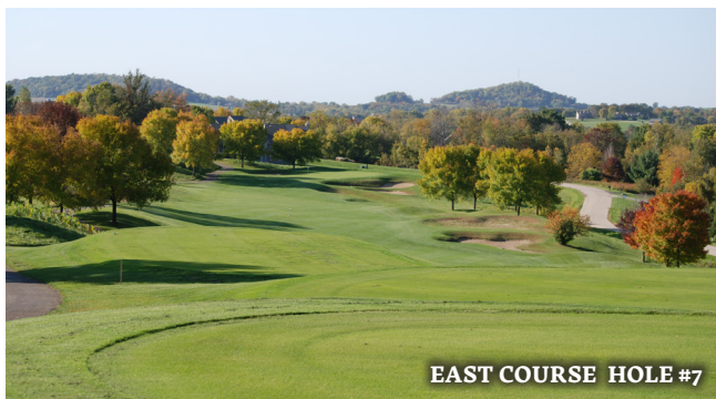
EAST COURSE HOLE #7