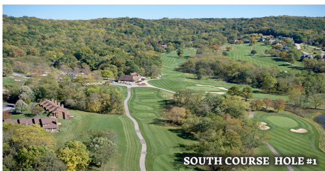
SOUTH COURSE HOLE #1