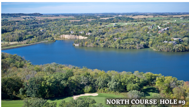
NORTH COURSE HOLE #9